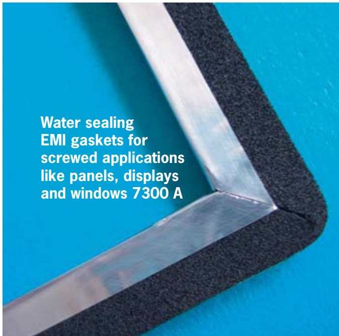
Water sealing EMI gaskets for screwed applications like panels, displays and windows 7300 A

The 7300 series EMC / IP gaskets are cost-effective combinations of an EMI shielding gasket and a water seal. This product comes with a self-adhesive strip.